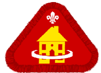
June is Home Safety Month

3.) Keep escape routes clear. Clean out clutter. Move any furniture that blocks your way. Make sure doors and windows