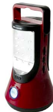
GPX Weather Dual LED Lantern with Instant Weatherband AM/FM Radio.

To find a weather radio transmitter that serves your location, go to the following website: http://www.nws.noaa.gov/nwr/CntyCov/nwrIL.htm .